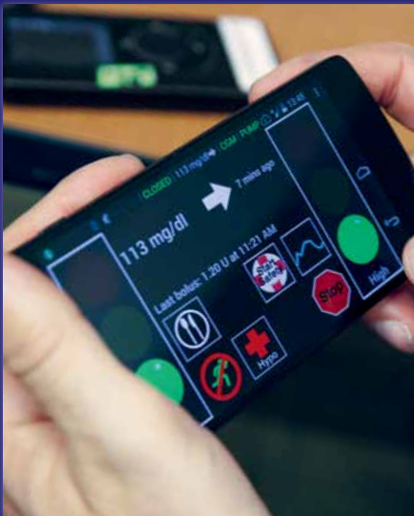
A subject monitors the algorithm running on his smartphone.